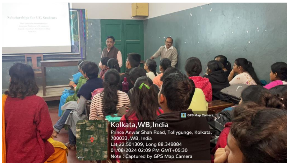
Helpdesk for SVMCM Scholarship