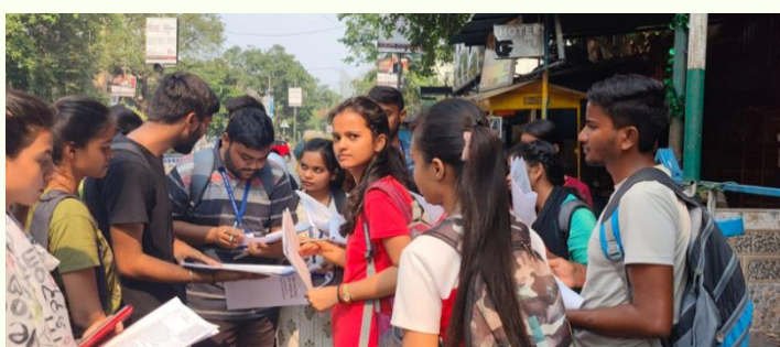
National Survey on Unemployment