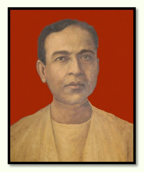
(July 1862- Feb 1951)