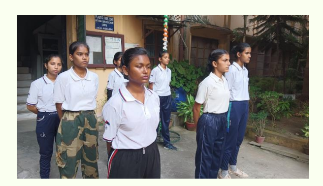
Our NCC cadets