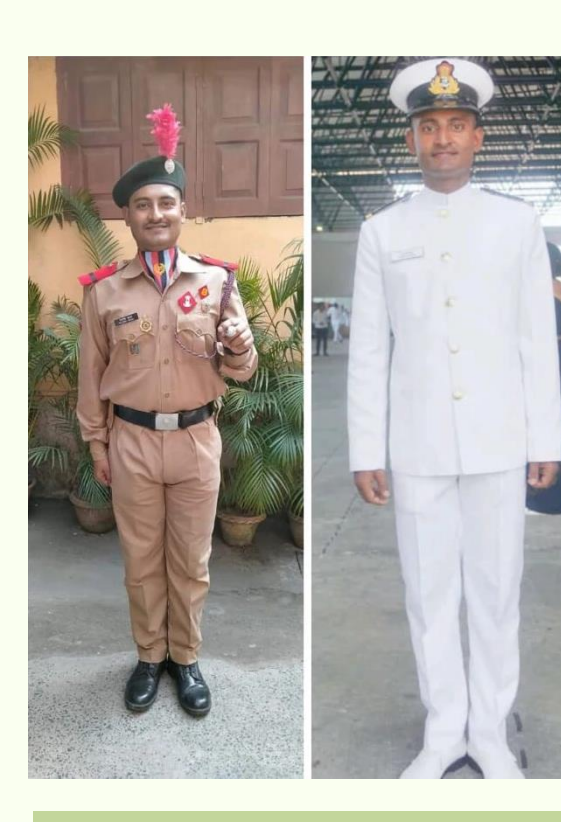
Our pride: NCC cadet of our college serves as a sub-lieutenant in the Indian Navy