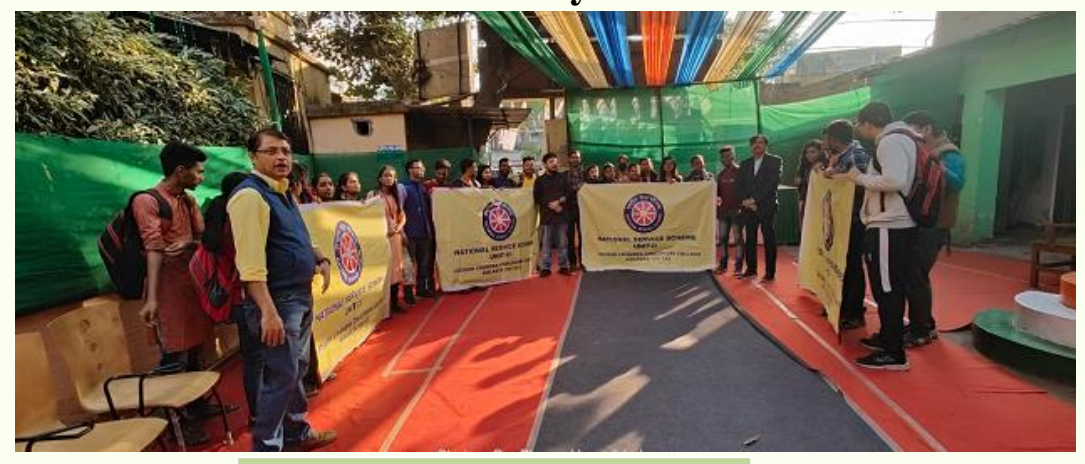
The four NSS units of our College