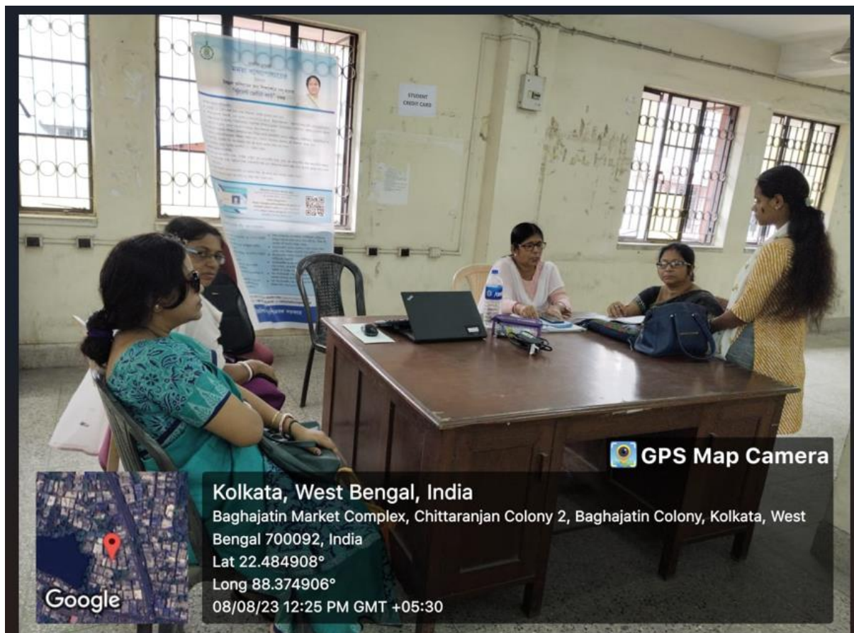
Geo-Tagging Image of the MSME Camp